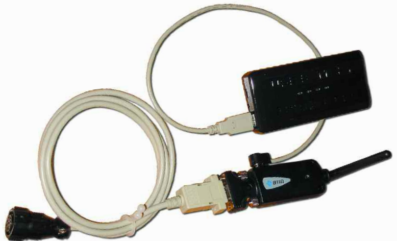
The bluetooth Pilot (bottom right) with pilot plug connector attached. Also attached is the USB battery pack. Not shown is a USB travel charger. The total weight of all these components is less than 300g.