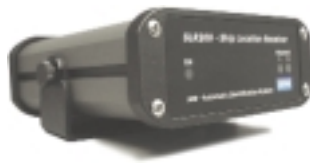
Length 140mm, width 120mm height 50mm, weight 600g